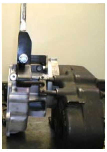
"T" handle linkage installed