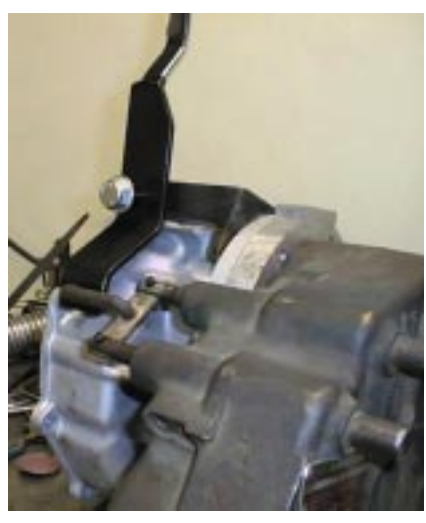
"T" handle linkage installed