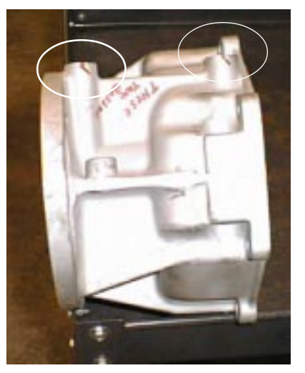
Cut off the stock Dodge shifter bosses

Hardware for the "T" style shifter has not been supplied due to the various different styles of aftermarket shift handles available.