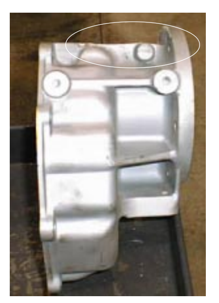
Modified to fit the transfer case shifter linkage